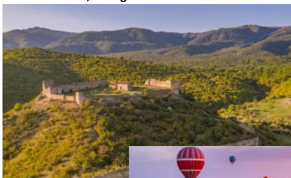
Manavi Fortress, Georgia