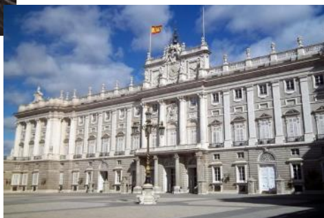
Madrid Royal Palace