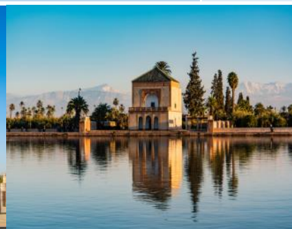
Menara Gardens, Marrakech