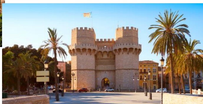
Tower of Serrano