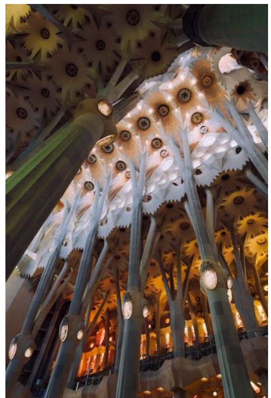
Inside La Sagrada Familia Church