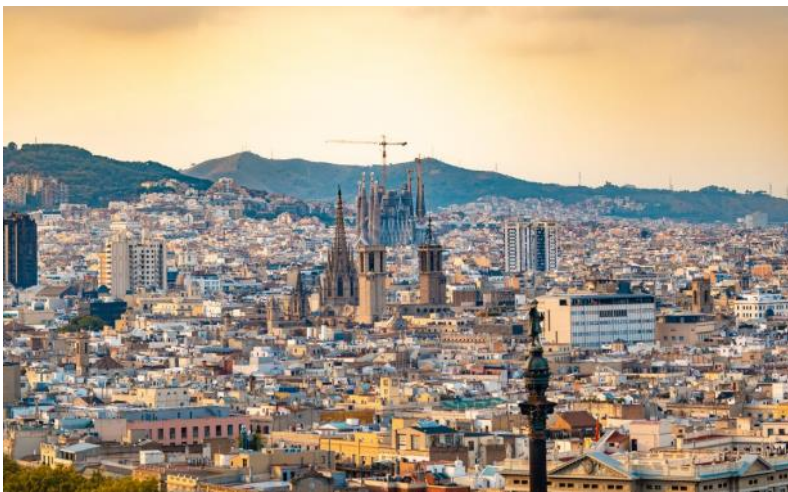
Welcome to Barcelona!