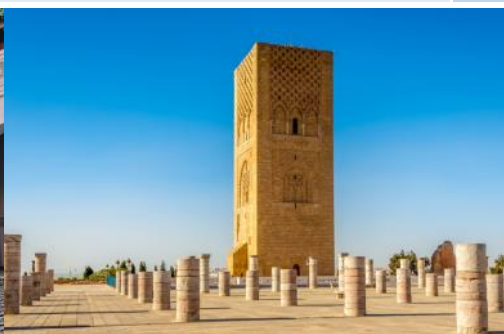
Hassan Tower, Rabat