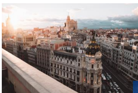
Welcome to Madrid!