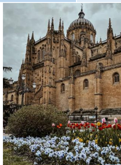
Above - Salamanca