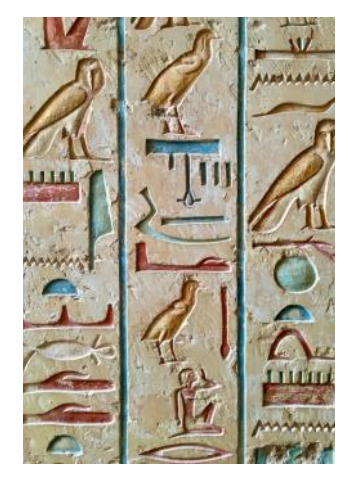
Above—Learn about the history and culture of the Egyptians