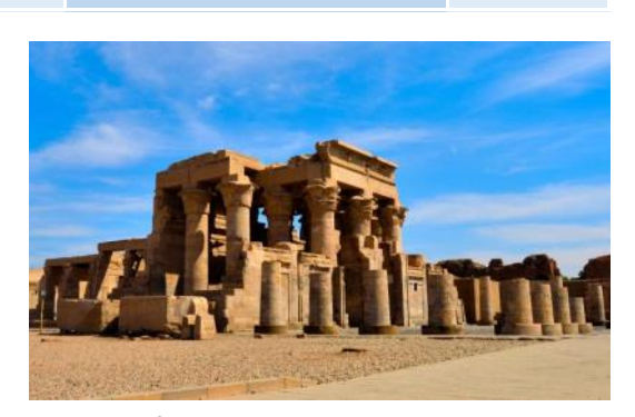
Temple of Kom Ombo