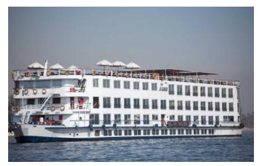
Nile cruise included!