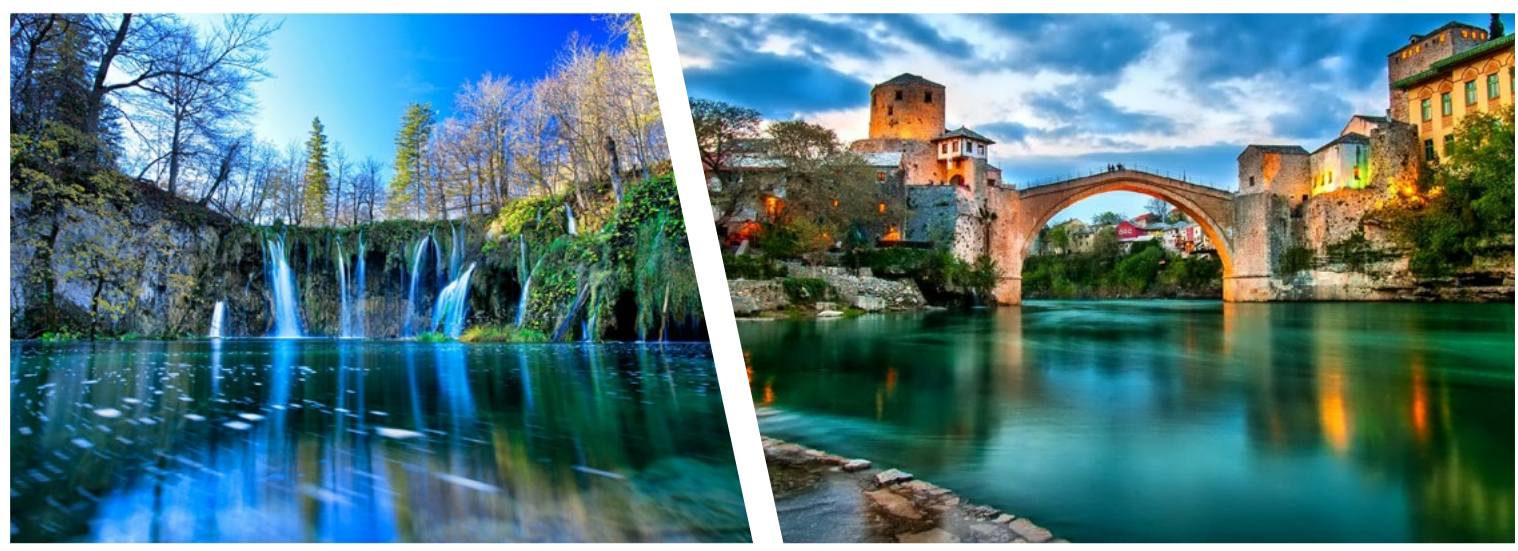
The mesmerising beauty of Plitvice Lakes (Croatia)

Overnight Stay – Mostar City Hotel or similar