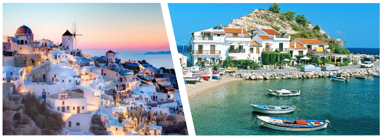
Whitewashed Oia village at sunset on the island of Santorini (Greece)

Your flight back home departs after midnight and arrives back into Melbourne in the evening. We hope you enjoyed your holiday! Meals – As per flight